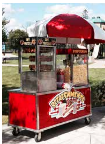
Popcorn & Pretzel Machines

Freshly popped theatre quality popcorn made on-sight! Great for any occasion! This is the most cost effective way to say "Thank You" to your employees and customers. This set-up comes with catering carts an umbrella and one staff member for two hours.